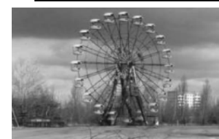
Chernobyl after the accident