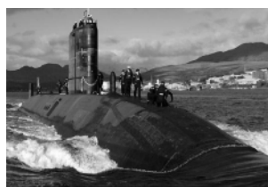
A Nuclear submarine