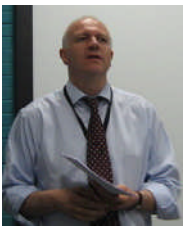
BILL RAMMELL MP Minister of State for the Armed Forces

My advisors said that coming here would be going into the Lions den. But I disagree with the premise. To suggest that there is a fundamental disagreement between two opposing sides presupposes a them-and-us mentality. I disagree with that because I've been a minister at Education, the Foreign Office, and Defence. At all three departments I've taken decisions and have found that has rarely been an easy option. Ministers take a range of advice when taking decisions, especially when these relate to our servicemen and women. If you compare government today with, say, thirty years ago, we are hugely more open when it comes to communicating our policies and, perhaps more important, disclosing the thinking behind them.