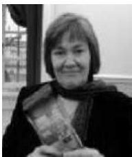
CLARE SHORT MP for Birmingham Ladywood and formerly Secretary of State for International Development