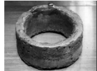
A plug of plutonium