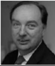
NORMAN BAKER MP for Lewes