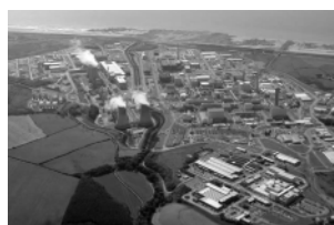
Sellafield from the air