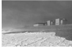
Water creeping up to Sizewell B

People are voting less because they trust less. We're talking about issues of trust; trust in government policy, in science, expertise, and